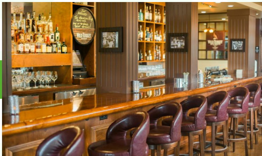
Eldorado Bar and Whisky Tasting Room