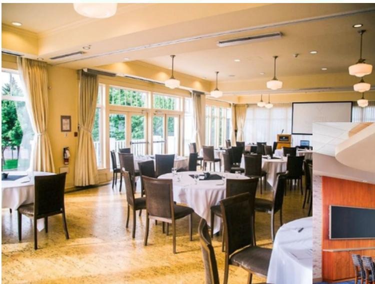
Manteo Great Room and Boardroom