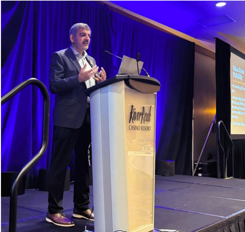
Seminar Presenters and 50/50 draw for WICC BC